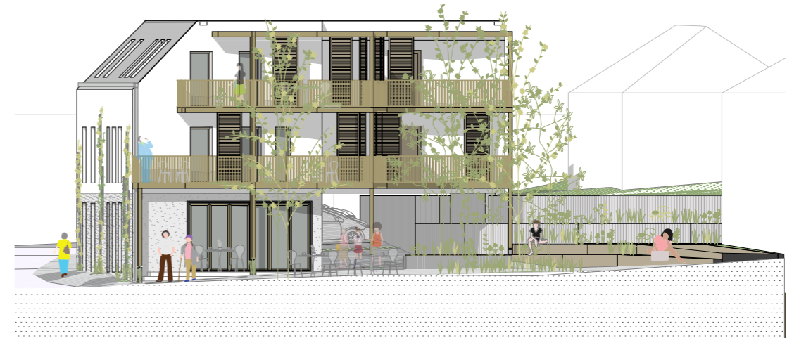
ANSICHT OST-SÜD 1:200